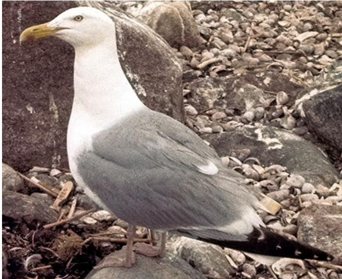
Adult Herring Gull.

In this month's Nature Notes we continue our study of area gulls and take a look at the impact Grey Wolves had on the local economy during the colonial era.